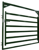
HIGH-QUALITY BOW GATES