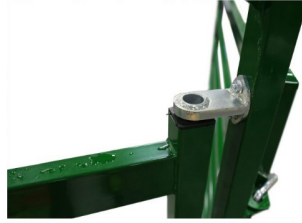
MAINTENANCE-FREE BOW GATE HINGES