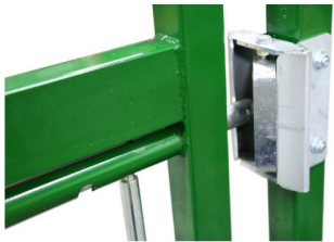
NO MISS SLAM LATCH FOR BOW GATES