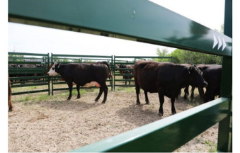
BOW GATES AND CORRAL PANELS THAT PREVENT BRUISING

Model: 4 ft Walk Through Bow Gate Weight: 130 lbs. Dimensions: 2" x 89" x 50.5"